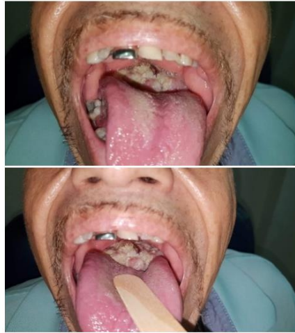
Figure 1: Physical Examination of the patient