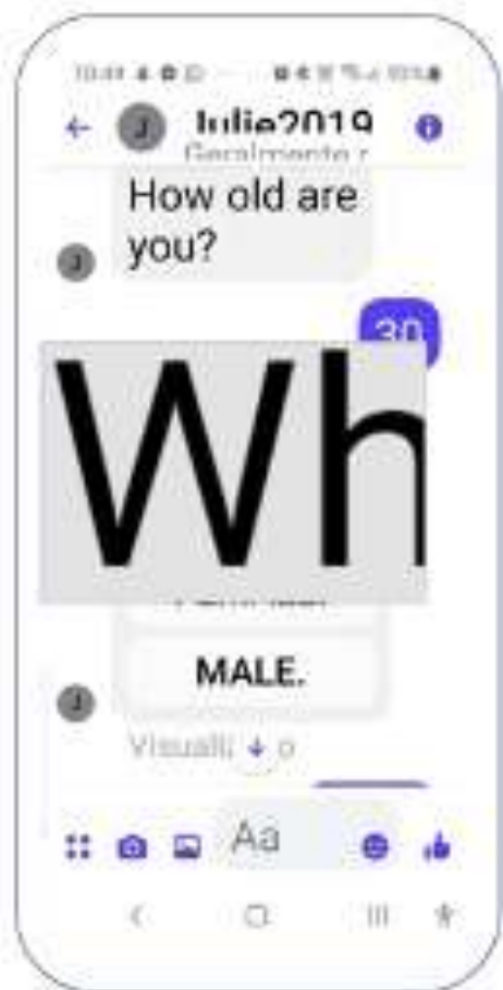
Figure 3: Smartphone font adjusted up to 30 mm of height. The authors took a print screen from the smartphone used on the tests.

The application of any questionnaires using CB doesn't generate a diagnosis by this virtual assistant. Therefore, this prototype doesn't provide a diagnosis, but identifies the likelihood of being currently depressed. The results showed that the conversation flow didn't present any issues. However, a possible problem that could cause confusion is when one question is sub-divided into more than three