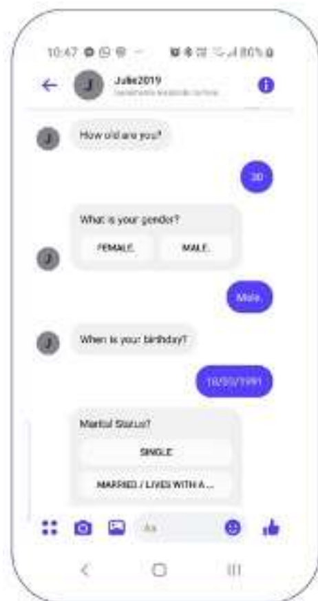
Figure 2: Sociodemographic Questionnaire on Messenger®. The authors took a print screen from the smartphone used on the tests.