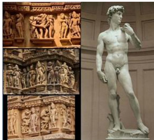
Figure 7: On left: Decorative sculpture in the Khajuraho group of monuments (Madhya Pradesh, India). Top: Erotic scenes. Middle & Bottom: Sculptures of the western group of the Khajuraho temple complex v/s. On right: David, Renaissance sculpture, created in marble between 1501 and 1504 by the Italian artist Michelangelo.