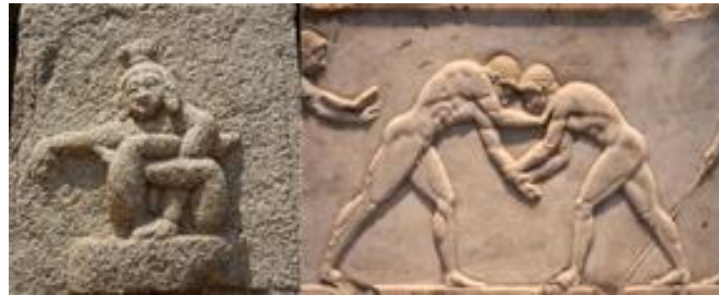
Figure 6: On left: Asana image carved on temple pillars at Hampi 16 th century, Karnataka. v/s On right: Funerary relief (510–500 BC) depicting wrestlers