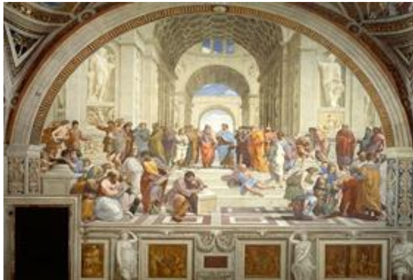
Figure 1: The School of Athens (1509-1511), fresco by Raphael

Alternatively, we could also say that the staple food, regional diet habits, and climatic conditions in that culture can be seen in the people's physical appearance that can be varied from skin tone, height, lean bodies, etc. The staple food, daily diet and all the environmental factors have an effect on once body subsides on the appearance of all people in the community. So we can directly or indirectly imply that food, diet, climate, and physical activities primes human appearance which indirectly or directly can be seen in sculptures are the paintings that depict human figures, daily life in that culture and surrounding at that point of time. Also in other words we can postulate that certain physical aesthetics of the regional group can be common.