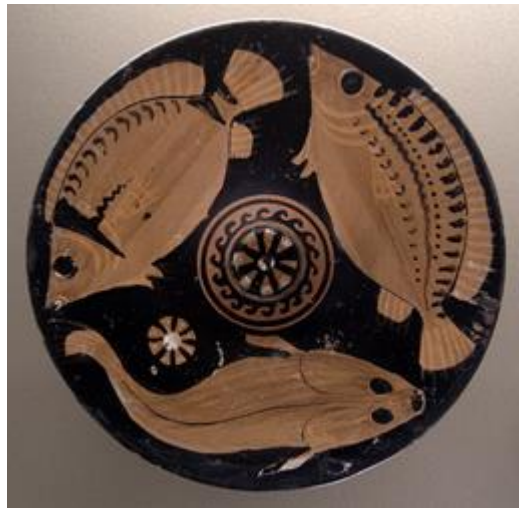
Figure 4: Fresh fish, one of the favourite dishes of the Greeks, platter with red figures, c. 350–325 BC, Louvre