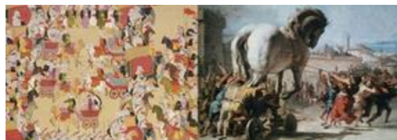
Figure 8: On left: A battle scene from Mahabharata by INDIA, KANGRA, CIRCA 1800 v/s On right: The Procession of the Trojan Horse into Troy from Two Sketches Depicting the Trojan Horse, oil on canvas by Giovanni Domenico Tiepolo, c. 1760; in the National Gallery, London.