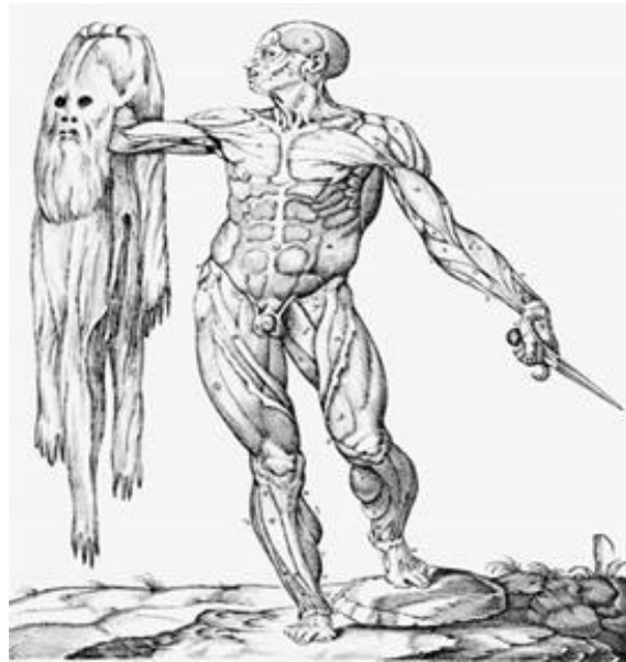
Figure 2: The flayed muscle man holding his skin and flaying knife attributed to Gaspar Becerra in Historia de la Composición del Cuerpo Humano (1556) by Juan Valverde de Amusco.