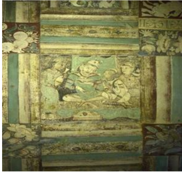
Figure 3: A decayed ceiling painting from Ajanta caves showing an apple, a fruit on the plate. (Om P., 1961)