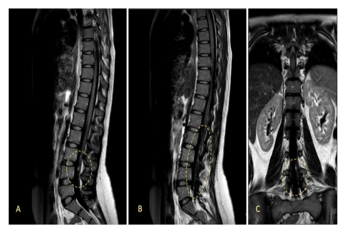
Figure 3: MRI study after one cycle of adjuvant chemotherapy, showing several millimetric nodular lesions with gadolinium contrast enhancement inside the dural sac and the roots of cauda equina, suggesting an early relapse of ES with meningeal carcinomatosis. Sagittal vision (A, B) and coronal vision (C) with a fluid attenuated inversion recovery (FLAIR) sequence.