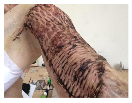
Figure 4: Condition (1 month later) after excision of the tumor on the right leg.