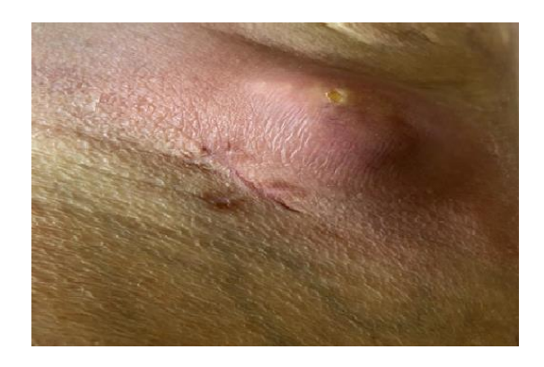
Figure 5: Right inguinal lymph node metastases (physical examination).