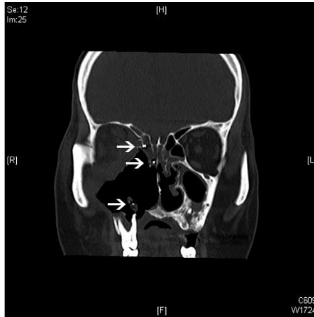
Figure 1: Computed tomography scan of the head in coronal cut.

Three radiopaque radioactive seeds (arrowed) were seen with the bottom one embedded in the dislodged tumor mass down the maxillary sinus. Note patient’s history of right maxillectomy was also evidenced.