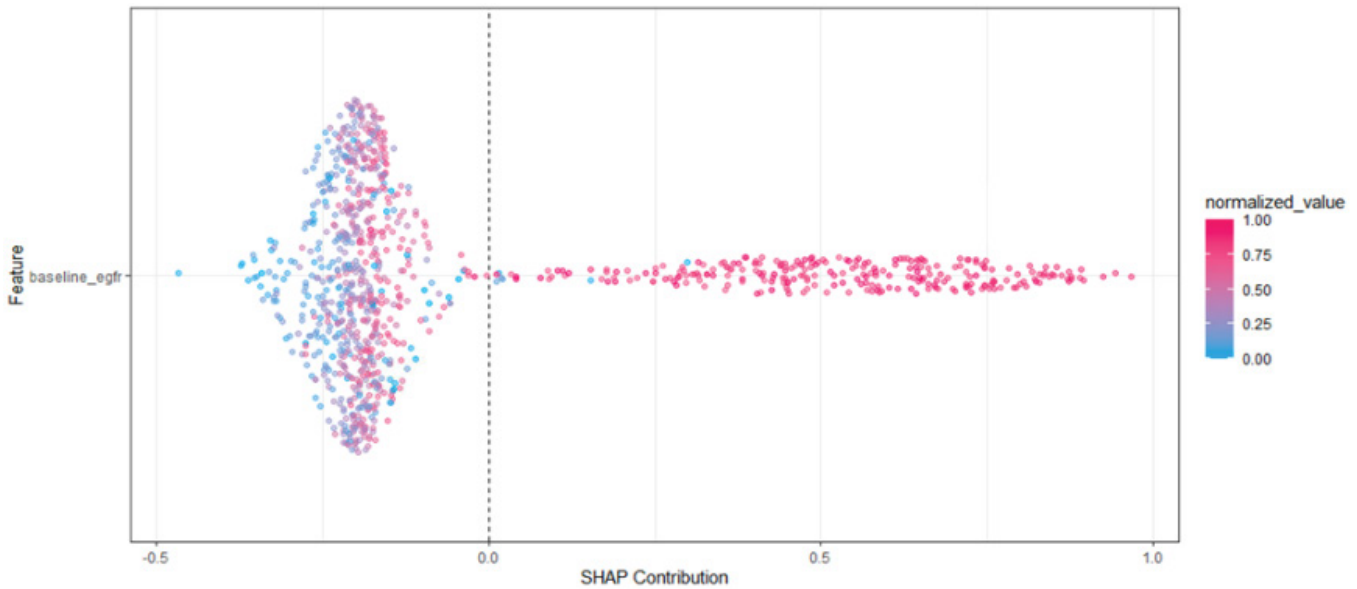
Figure 2: Shapley summary plot dependence plot showing relationship between baseline eGFR and rapid CKD progression