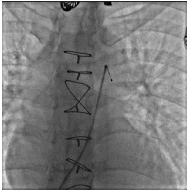
Figure 4: Denervation of the left PA