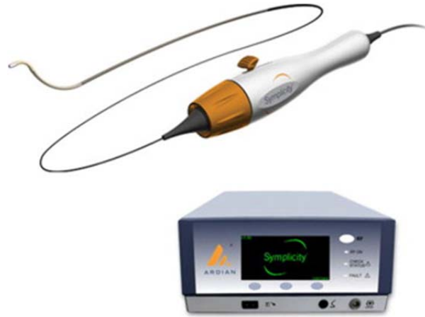
Figure 2: Simplicity Denervation System

After withdrawing slightly the guiding catheter and pushing forward the Simplicity catheter, the steerable tip would be released from the guiding catheter (Figure 3).