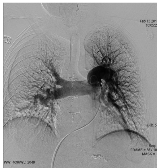
Figure 1: Angiopulmonography

A baseline PA angiography was performed to identify the PA bifurcation level and evaluate the PA diameter (Figure 1).