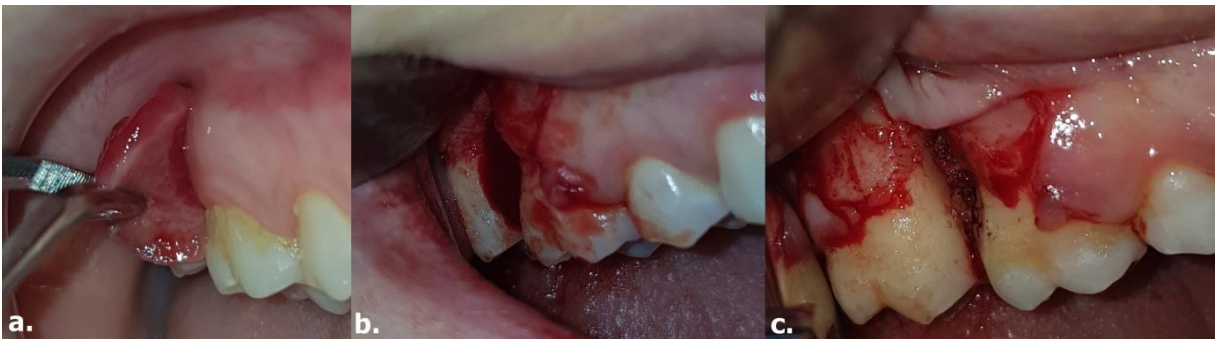
Figure 1: a) The clinical appearance of lesion (15x9x3 mm); b) Hemorrhage after excision; c) The feeder vessel site after cauterization.

arch. The clinical appearance of the lesion was granulomatous, reddish, with a pedunculated base, measuring approximately 15x9x3 at buccal aspect (Figure 1a). The patient stated that PG excision had been performed several times before but recurrence occurred within 2 weeks. Radiolucent area was determined between the right maxillary first and second molars on panoramic radiography in routine examination (Figure 2). After, T2 TSE Magnetic resonance imaging was performed. In MR, the presence of three intraosseous vessels in the right maxillary posterior region was determined (Figure 3). The patient was informed and consent. The lesion was removed by excisional biopsy (Figure 1b). The fragments were individually sent for histopathological examination. The microscopic sections of the main lesion revealed capillary PG. The image revealed a large vessel in the interproximal bone between the upper right the first and second molar, associated with the lesion. This vessel may be feeder so a blood vessel was exposed and cauterized with electrocautery (Figure 1c). After 4 months control follow up, no signs of recurrence were noted.