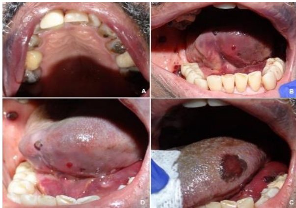
Figure 2: Clinical photo of the oral cavity illustrating multiple ecchymosis affecting the patient's upper vermilion and labial mucosa, ventral tongue, left dorsolateral tongue, floor of mouth and right buccal mucosa.