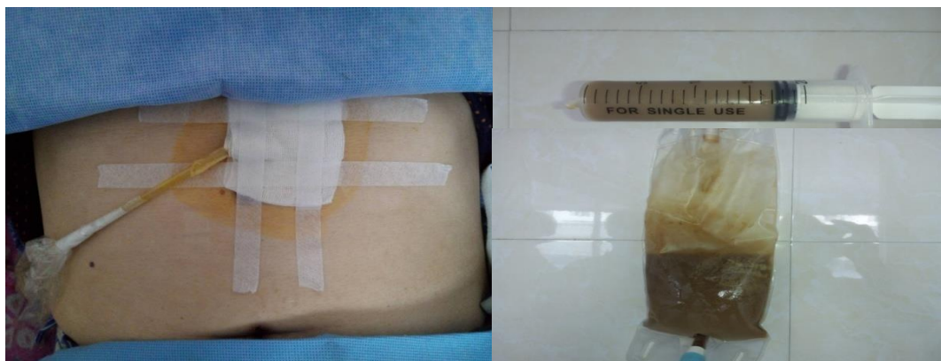
Figure 1: Transperitoneal placement of drain and drained fluid.