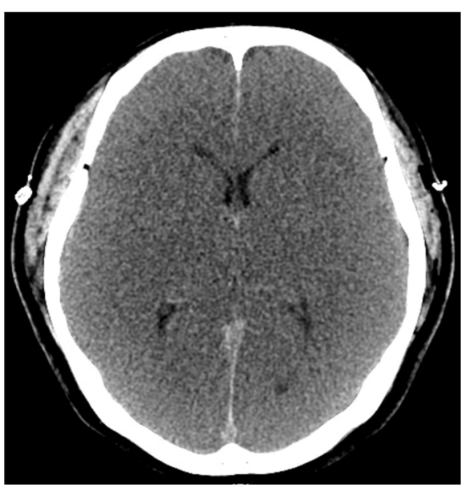
Figure 1: Hypo-attenuated brain with effacement of the greywhite interface and basal ganglia consistent with generalized brain hypoxia.