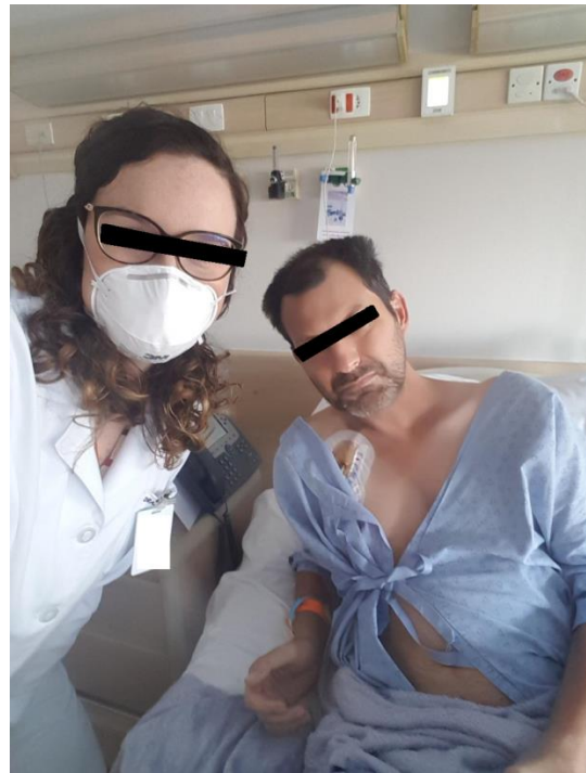
Figure 3: Patient picture taken while he was still in the hospital accompanied by one of the emergency team doctor who was wearing mask due to the 2020 coronavirus pandemic.