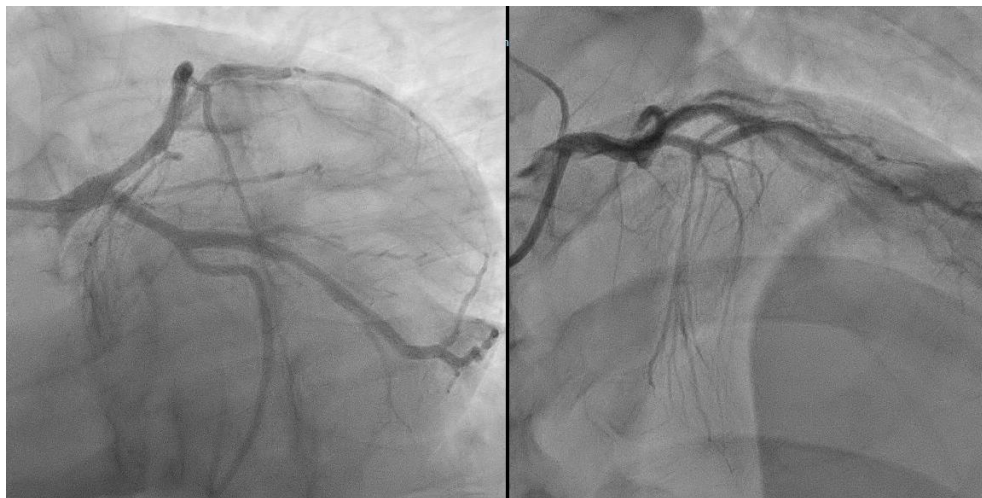
Figure 2: Cardiac catheterization showing total occlusion of the anterior descending artery in its middle third.