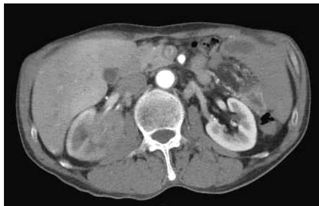
Figure 1: An Axial computed tomography (CT) image of the patient showing a poor enhancing infiltrating lesion over the right upper pole of his kidney(arterial phase).