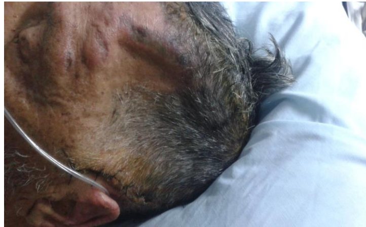
Figure 1: Scalp depression regarding craniectomy.

improvement: regaining of the state of consciousness before the deterioration and disappearance of the convulsions and skin depression.