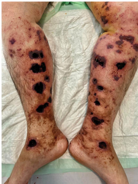
Figure 1A: Extensive necrotic and hemorrhagic ulcers surrounded by a brown livedo