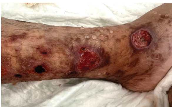
Figure1B: Many porcelain-white scars called « atrophie blanche » with residual postinflammatory hyperpigmentation