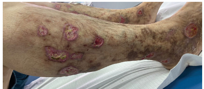
Figure3: at 4 weeks after restarting rivaroxaban, 10 mg daily.

monoclonal gammopathy of undetermined significance. The therapeutic management consisted of corticosteroid therapy and Rivaroxaban at 10 mg daily. In week 2, we suspended steroids and adjusted the Rivaroxaban dose to 20 mg per day for 6 months. A good evolution was noted with regression and the lesions' healing and the pain's disappearance within one month [Figure 3]. We recommend the use of compression stockings after complete healing. The patient is referred to the hematology department for complementary assessment. At follow-up 1 year later, the patient remained in remission and there was no recurrence of skin.